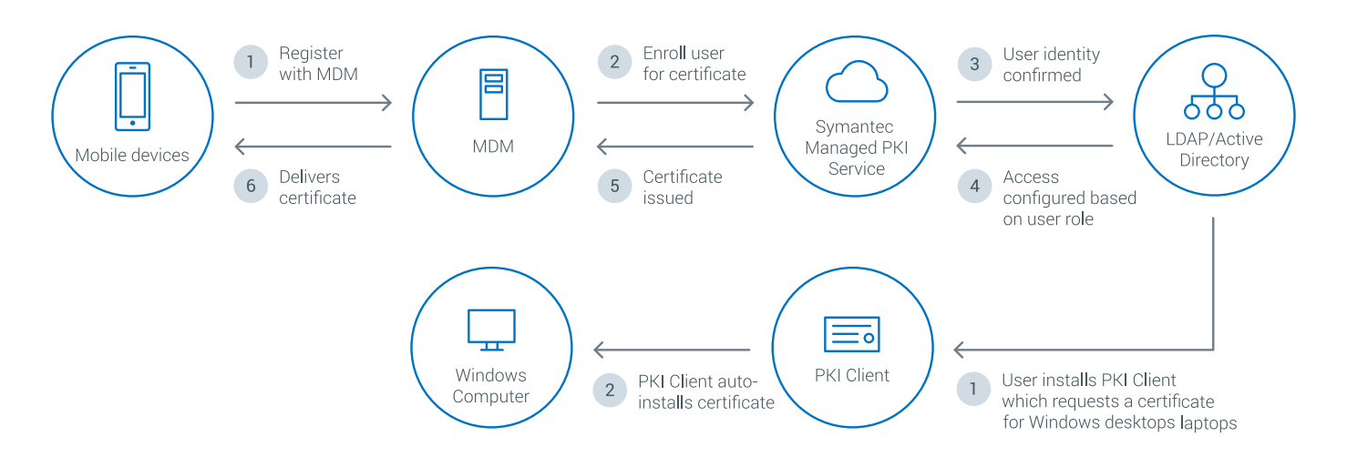
Figure 4: Direct device support through mobile-aware certificate service

For devices that don't have an iOS OTA equivalent, such as Android devices, Microsoft Windows® or Apple Mac® tablets, DigiCert provides a Windows PKI client that similarly hides the complexity of configuring the device and application to use the certificate.